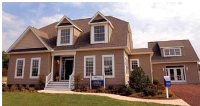
The Belle View Model is one of four models you can wait up to two years to build with the Lighthouse Crossing Buy-Now-Build-Later plan.

For more information about Lighthouse Crossings, call 877-436-9157.